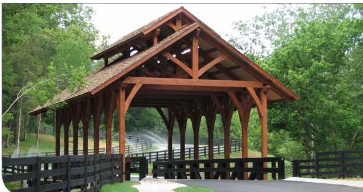
Covered Bridges - offer complementary aesthetics for a context-sensitive site solution