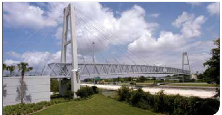
Cable-Stayed – custom cable-stayed bridges offer lengths up to 300 ft.