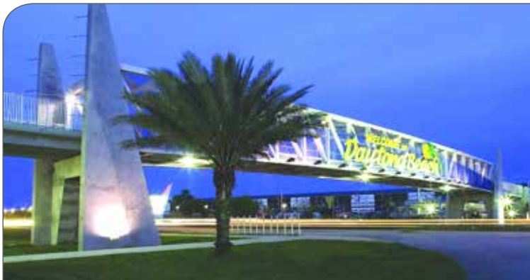
Overpasses – high profile pedestrian truss overpasses