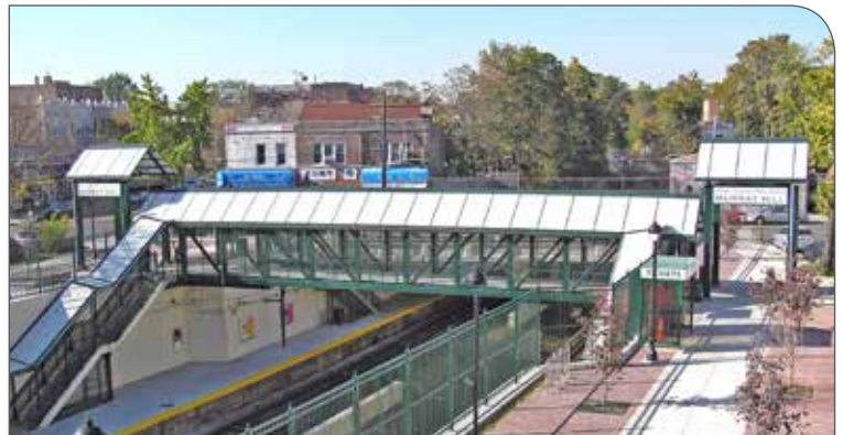
Public Transit Access – convenient option for pedestrian traffic in tight enclosures